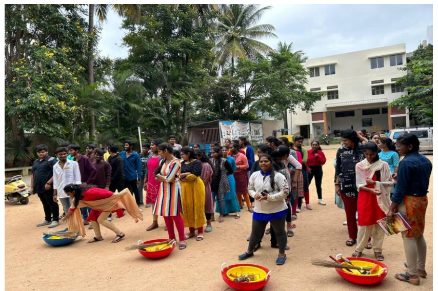
National Toga Day